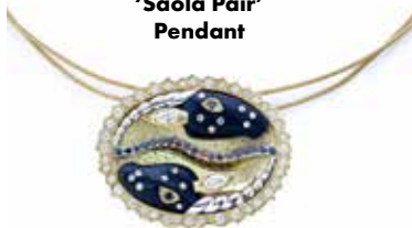
'Saola Pair' Pendant

At present we are working industriously on creating our 12th, bi-annual, exclusive jewellery Collection, consisting of a myriad of unique, one-off pieces, handcrafted in our own workshop. This year's Collection, entitled 'See Me', will be launched in late November, so, for the time being, the content of the Collection is under wraps. Stay tuned to our Facebook and Instagram to find out more!