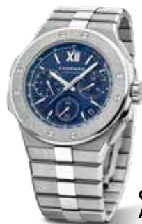
Chopard Alpine Eagle